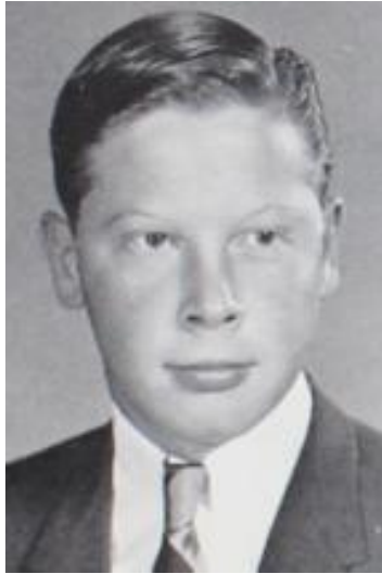
Del Rush 2015